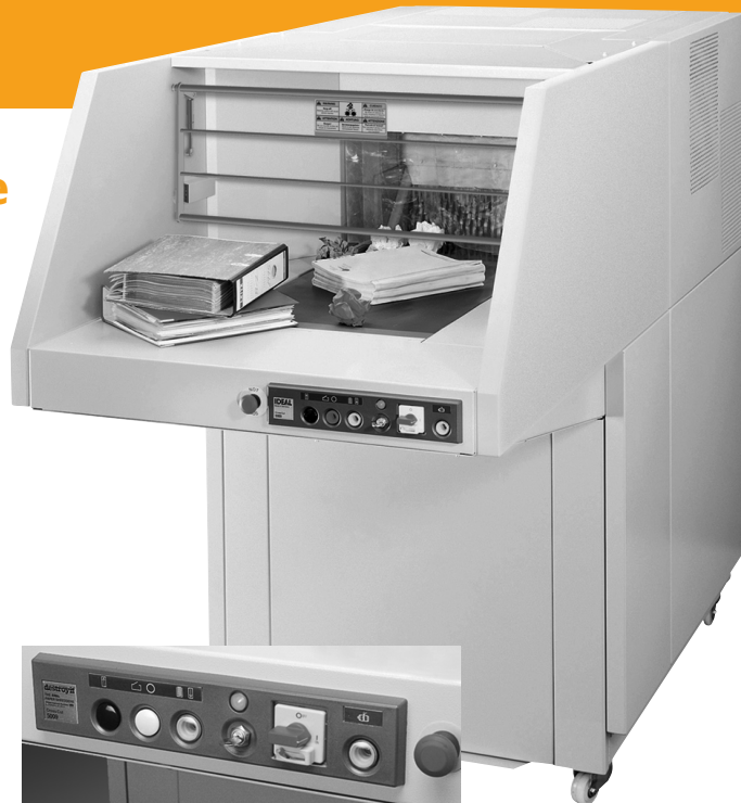
Easy to use control panel with optical indicators, push buttons for stand-by/stop/reverse and emergency stop button.

P.O. Box 40249 North Charleston, South Carolina 29423-0249 800-223-2508, fax: 843-552-2974 Parts and Service fax: 843-760-3814 www.mbmcorp.com sales@mbmcorp.com